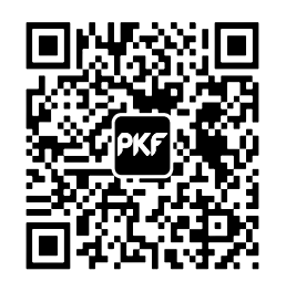
Follow us on WeChat Scan the QR code and get the latest PKF Hong Kong news

IMPORTANT NOTE: The information contained in this document is only for general information and is not intended to address the circumstances of any particular entities or individuals. Accordingly, this document does not constitute accounting, tax, legal, investment, consulting, or other professional advice or services. No action should be taken solely on the basis of the contents of this document which only contain a brief outline of the relevant laws. Before taking any action, please ensure that you obtain advice specific to your circumstances from your usual PKF tax partners or other tax advisers or liaise with the relevant tax authorities. We accept no responsibility or liability to any persons choosing to take action or implement business plans or activities solely or partially based on this document.